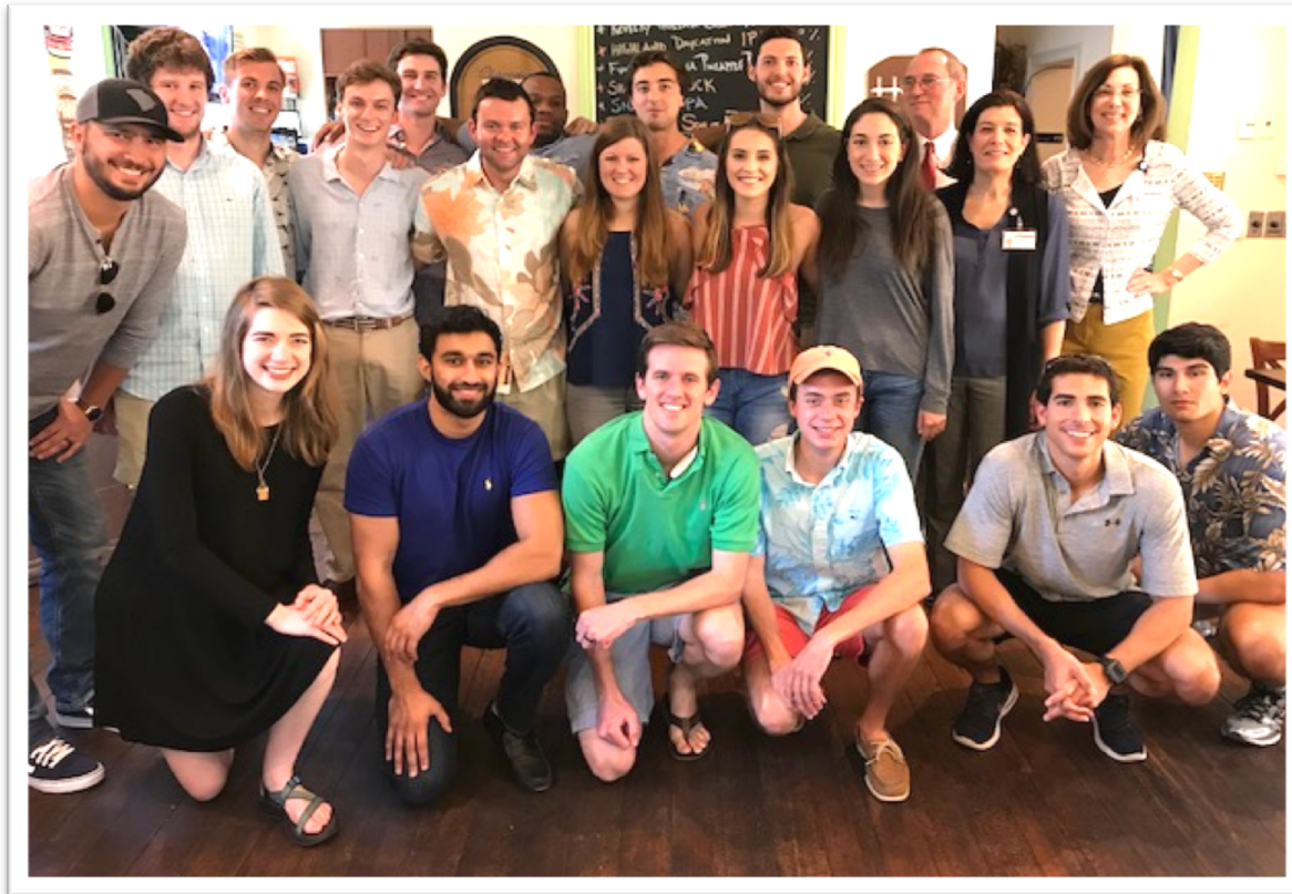
MSMS Class of 2017-2018